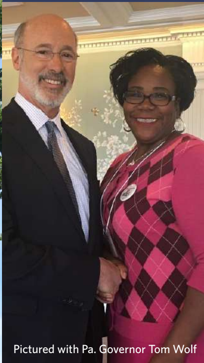
Pictured with Pa. Governor Tom Wolf