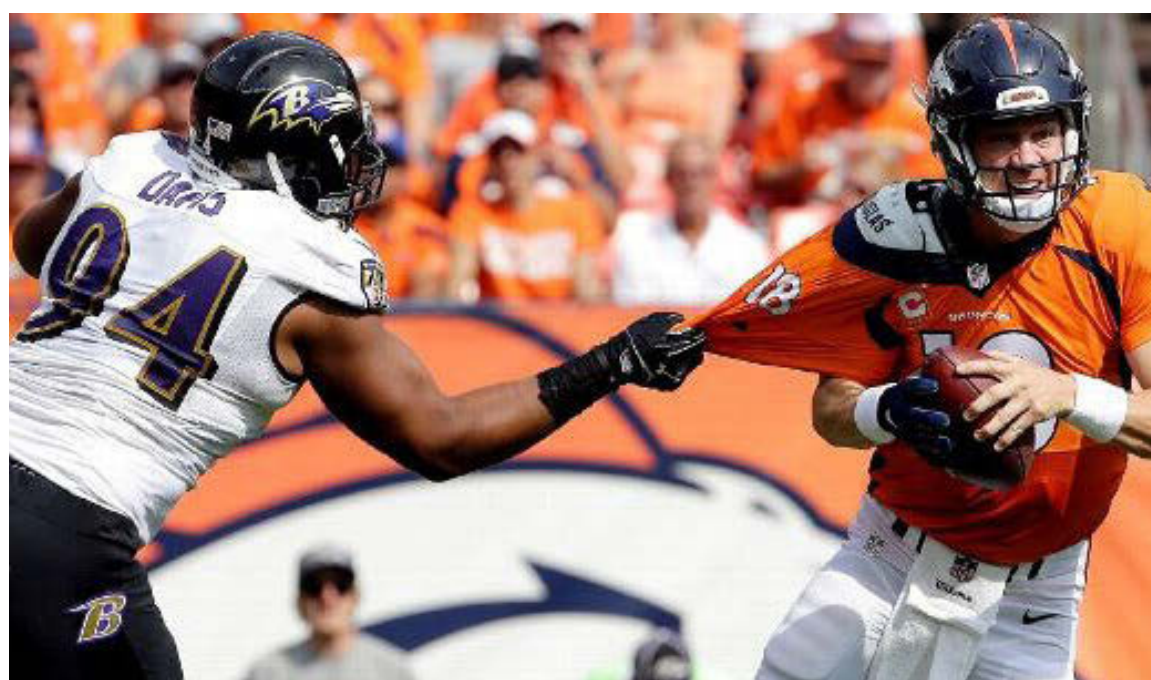
Manning tries to escape from a Baltimore defender during the Broncos 19-13 win on Sunday.