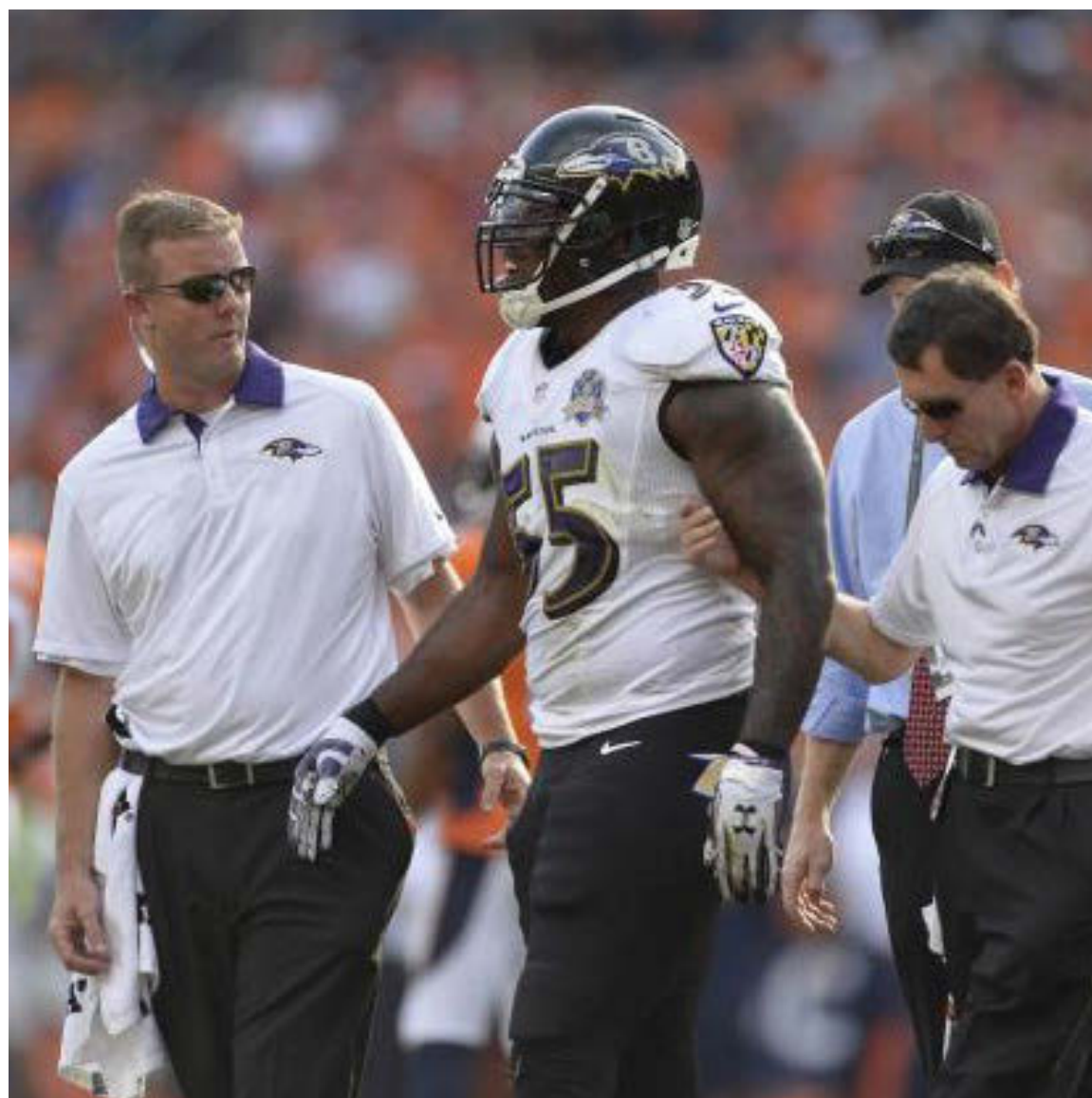
Baltimore Raven's linebacker Terrell Suggs is helped off the field after tearing his Achilles during the game.