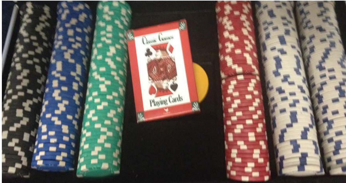
The chips that the Phis would use during their poker night would allow students to meet new students and have fun.