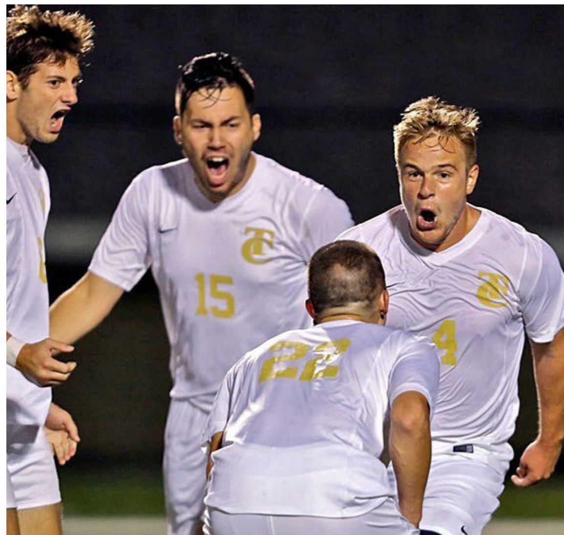
Tomcats celebrating after a goal on Tuesday in their first win of the season.

Your Tomcats will be in action again on Saturday when they head to Cresson, PA to take on the Mount Aloysius Mounties. The women's soccer team will be there as well to square off against the Mounties as well. The men are scheduled to start at noon and the women at 2 p.m.