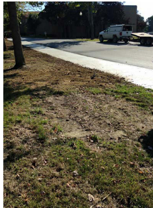
Sidewalks going down the length of Amelia Earhart Drive.