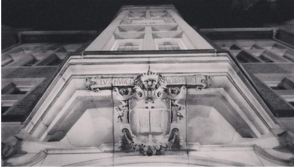
Dark Architecture Crystal Durachko