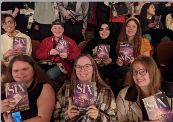
The DHI & Theater Dept. see the musical Six in March.