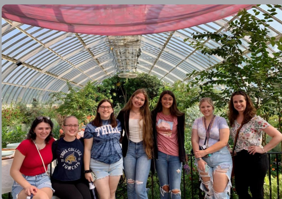
DHI students visit Phipps Conservatory in September.