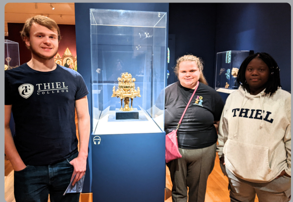
First-year students visit the Cleveland Museum of Art.