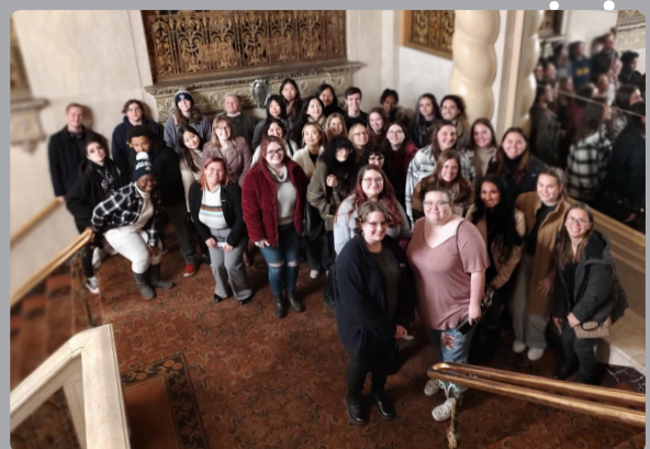
The DHI & Theater see Hadestown in November.