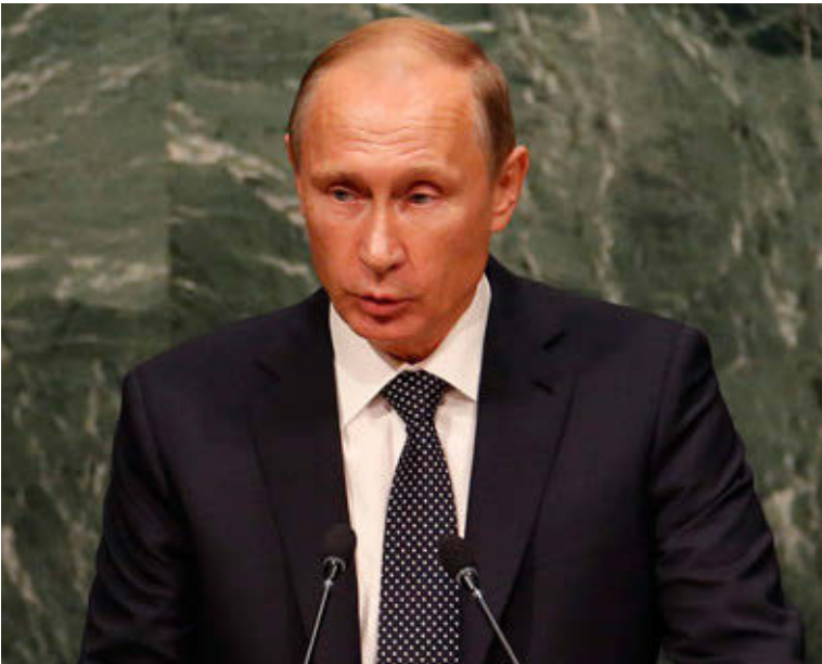
Putin giving his speech at the United Nations.

bility and economic problems, and how Putin had been very effective by destroying the mafia and dealing with corruption. Thus, many Russians look up