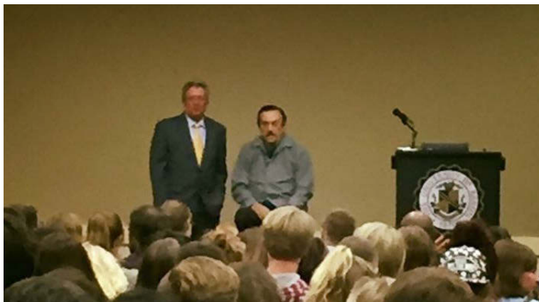
Dr. Philip Zimbardo gives presentation to 1,100 at the University of Akron

The line between good and evil is not as impermeable as once thought. Any one of us can be seduced into evil through dehumanization, group pressure, and de-individualization.