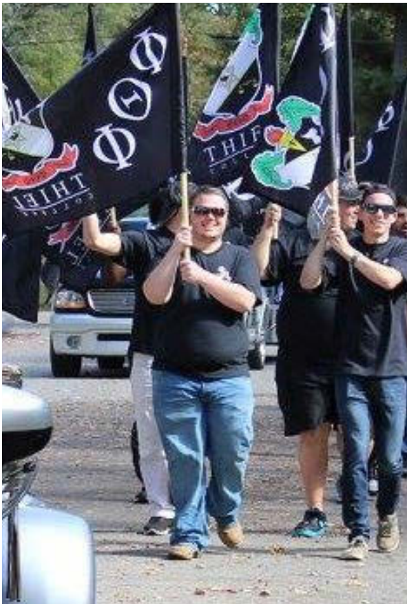
Brothers of Phi Theta Phi in Homecoming Parade