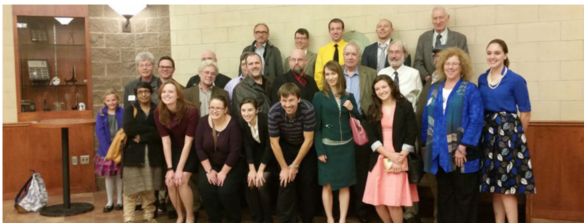
Attendees of the Conference pose for pictures