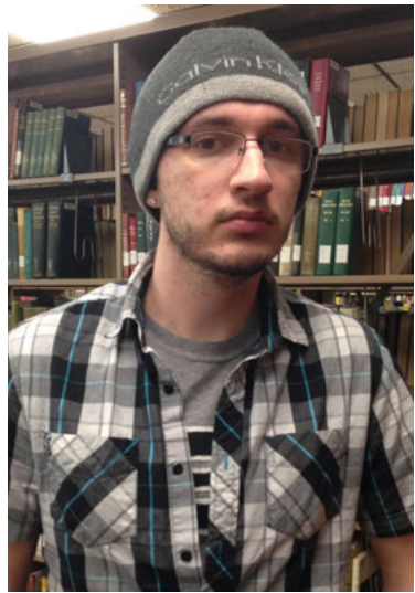
Chris Kafka, staff writer

The extra point has basically been automatic, with a conversion rate of around 99.6% in the NFL. There are occasions where crazy situations have occurred, such as former Cleveland Browns defensive tackle Shaun Rogers blocking an extra point, which greatly impacted the game against the Cincinnati Bengals. However, that was an outlier as compared to typical attempts for the extra point.