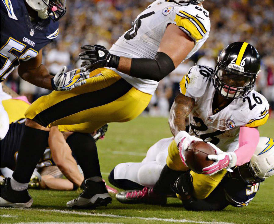
Le’Veon Bell reaches the ball across the goal line for the game winning touchdown.

However, the Steelers’ defense held and only allowed 3 points to give the Chargers the lead with 2:56 left to go. With the ball, Vick hit Heyward-Bey on several occasions, driving the ball down to the San Diego 41. On the next play, Vick did