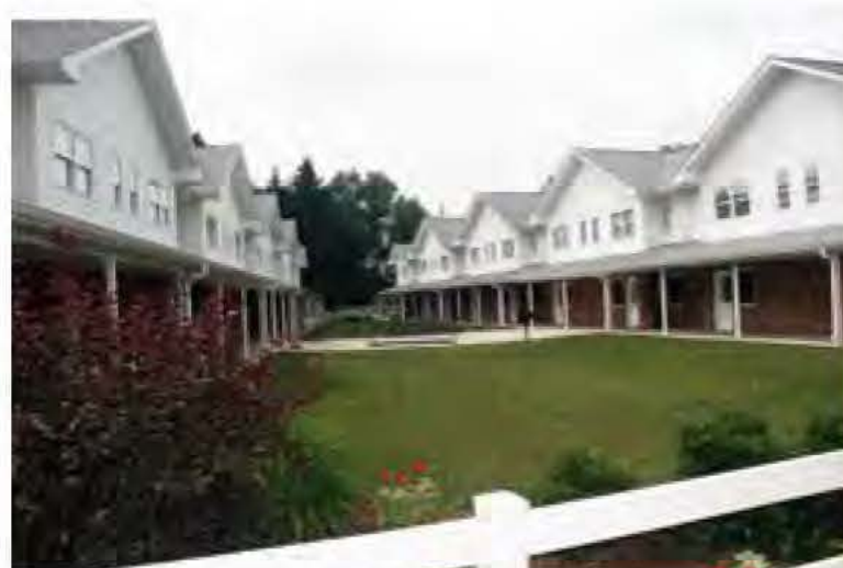
The townhouses prior to the explosion on Thursday.