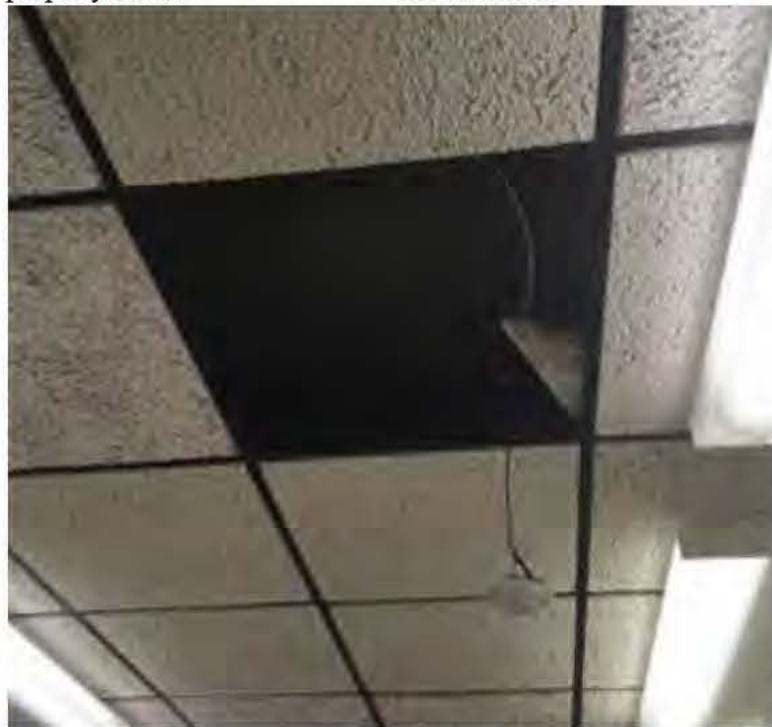
After a suitcase of money was found in the ceiling of the AC, a search was mounted for other surprises.