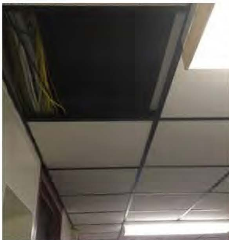
One of the leaky roof spots in the Academic Center had a surprise hidden within the wiring.

An investigation was conducted into the claims but nothing