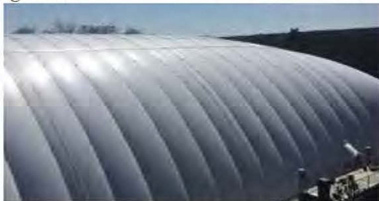
The Dome successfully passed another year of close inspection.

The dome is set up and removed every year by Thiel student volunteers and usually